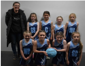
Grade 3 – Goal Getters