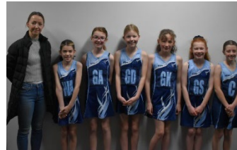
Grade 5 – Hot Shots