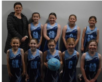
Grade 4 – Super Stars